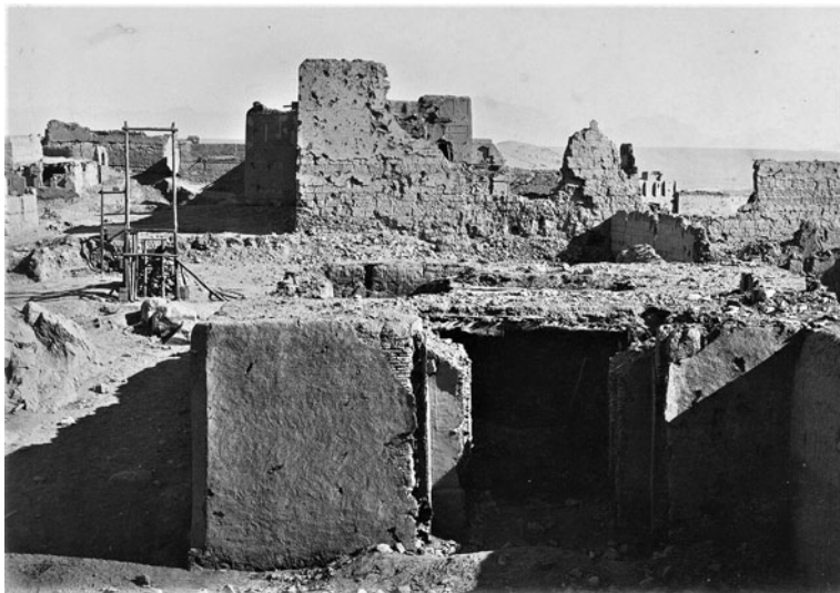
Fig. 3 During the Second Anglo-Afghan War, the British generals used public punishment as a disciplinary tool to communicate their power to the Kabul populace. This photograph, taken in 1879 in war-torn Bala Hisar, shows the hanging gallows on which they executed Afghan rebels.

what he had seen, and this sparked the deadly uprising. 86 This report, right or wrong, illustrated the power of bazaar news in shaping public opinion among Afghans.